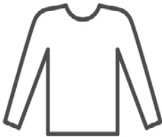
LONG SLEEVE SHIRT wool or cotton/denim, not synthetic